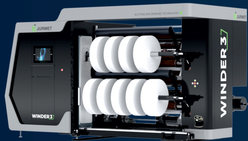
WINDER3 Compact duplex slitter - premium model