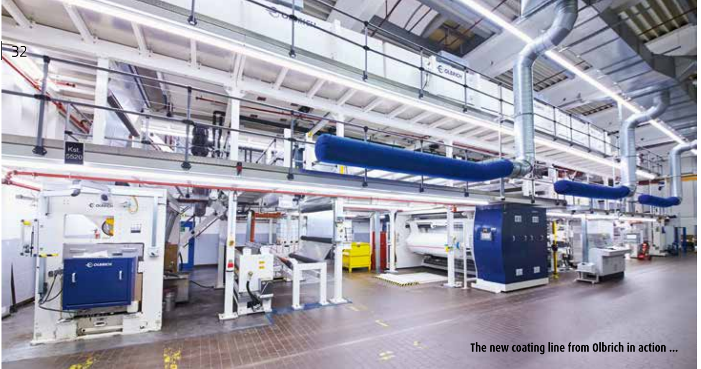
The new coating line from Olbrich in action ...