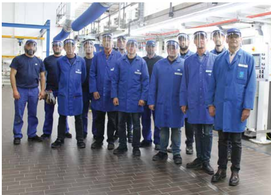
The team of B+K which runs the protective film production ...