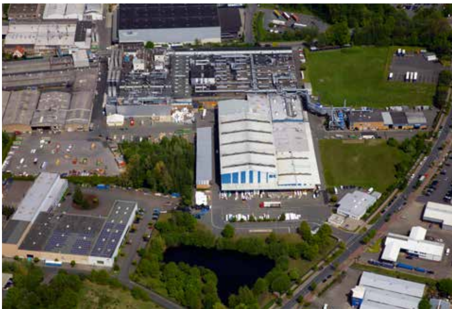
The premises of B+K in Lengerich

The product portfolio of B+K offers the entire range of flexible packaging solutions for different applications: from