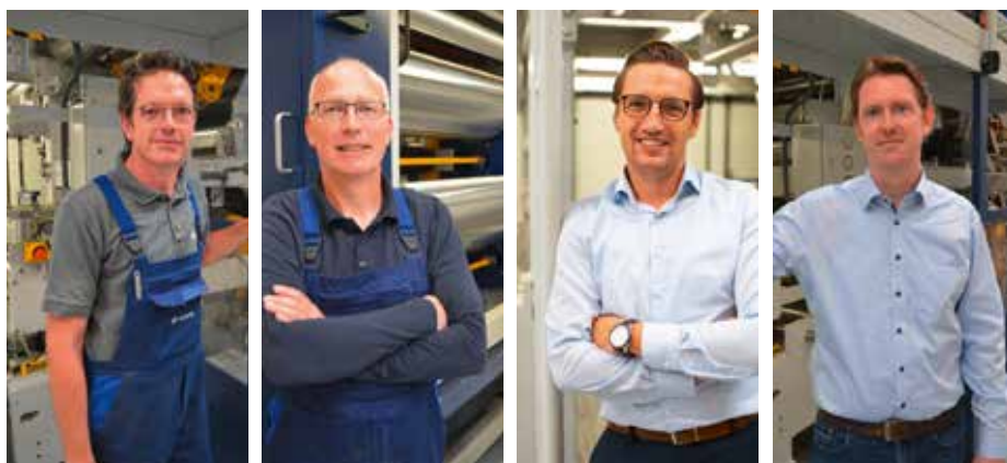
... and a part of the responsible team at Olbrich.