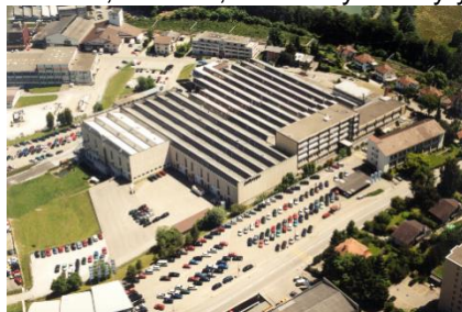
• Polytype Converting AG, Fribourg, Switzerland